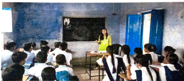
Photographs of the Awareness programme conducted at ARRACH HIGH SCHOOL (H.S) on 15 th March, 2023 with the students of class 9 th and 10 th .